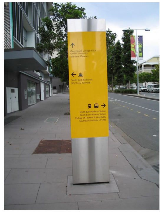
South Bank, Australia

This ultra-modern take on wayfinding signage stands out, is eye catching, and provides multiple symbols for various services, such as the bus and train stations. The print is a little small for drivers, but could work for pedestrians and cyclists.