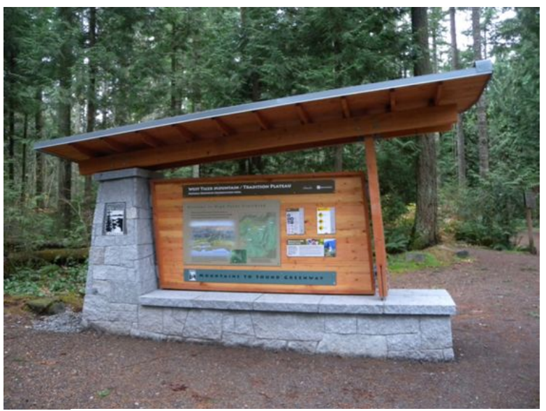
West Tiger Mountain (Near Seattle, Washington)

For outdoor recreational areas such as hiking trails, bike paths, river walks, or other similar areas, a map of the route is often beneficial. Maps are usually placed at entrance points to a trail and contain additional information such as the length of the trail, GPS location, and the location of amenities, such as restrooms, benches, and shelters users can expect to find along the way. The obvious method of disseminating this information is through a trailhead kiosk.