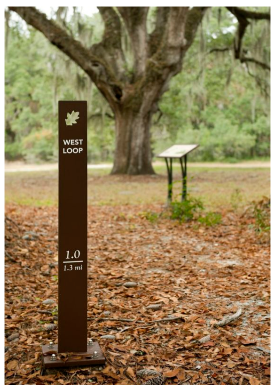
Charleston, South Carolina

Even throughout the trail, placing markers to keep new users on track is very helpful. The College of Charleston's four-mile nature trail contains trail markers that subdivide the trail and help users easily identify their location.